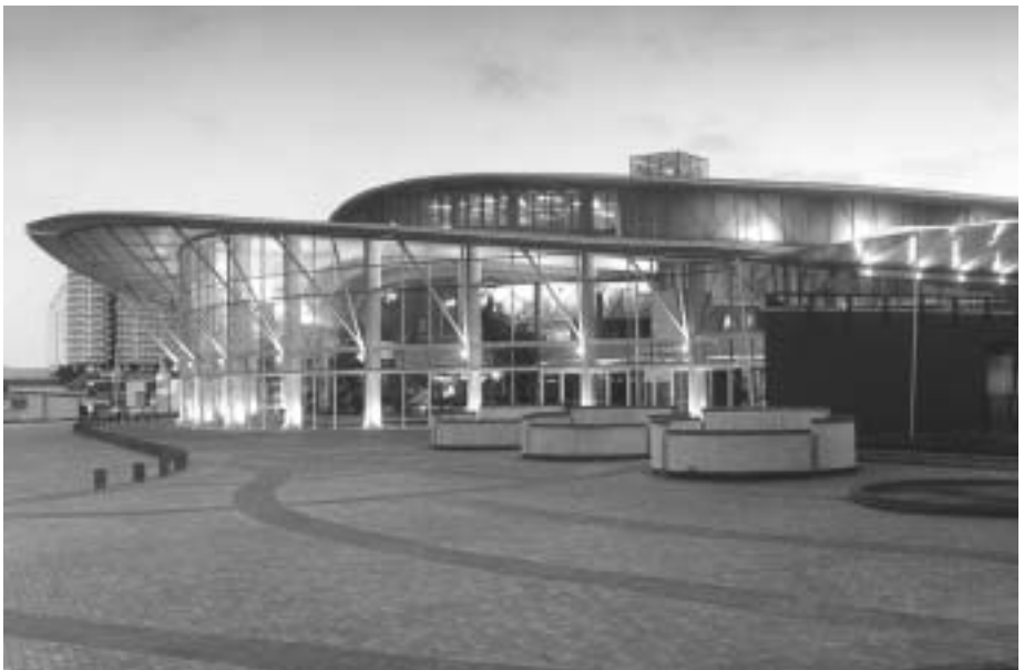
International Convention Centre ICC, Durban