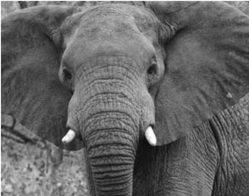
Elephant at Kruger Park