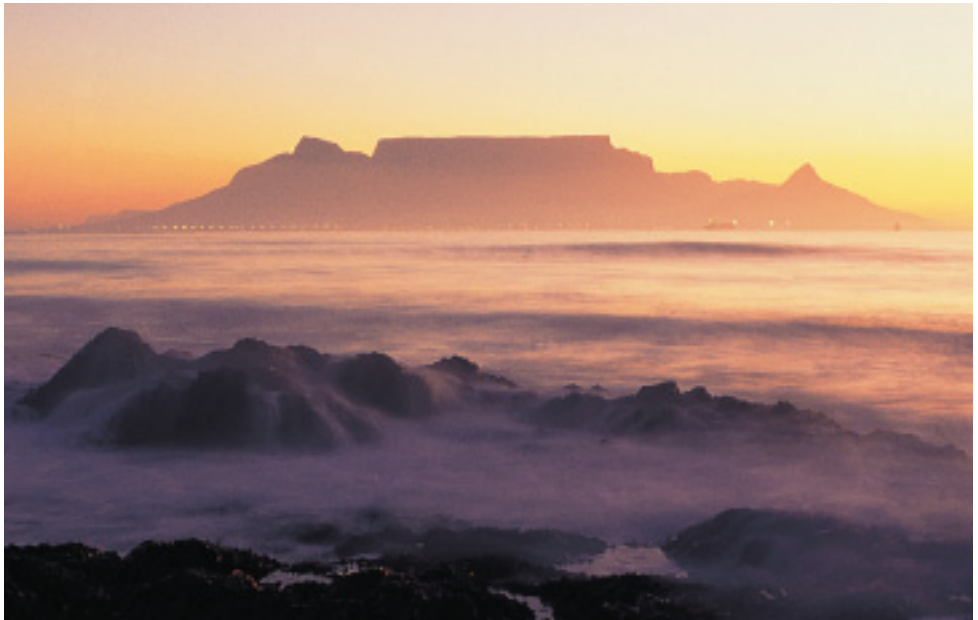
Fascinating view at Table Mountain

The organizers reserve the right to cancel tours in the event of insufficient participation. In this case participants will be informed in advance and fully refunded.