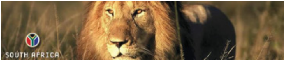
One of the "Big Five"

The Organizers of the International Association for Endocrine Surgery (IAES) have nominated the Durban Hilton Hotel as the headquarters of this group. The members of IAES are therefore encouraged to make their reservation at the Durban Hilton Hotel.